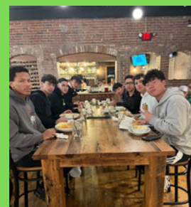
Lincolnton Eats on 1/31 frequented a nearby downtown favorite, Local Roots!

Sports Film Yoga Business Club Chess Club GOATS Success FCA Breakfast Club Cooking Club Cornhole Club Lincolnton Eats Meditation Club Life Skills Club Service Club